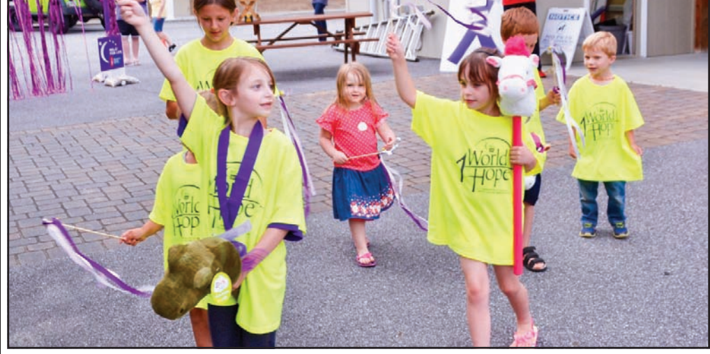
Children participated in the 2021 return of Union County Relay For Life, pictured here during the Survivor and Team Parades portion of the May 22 event.