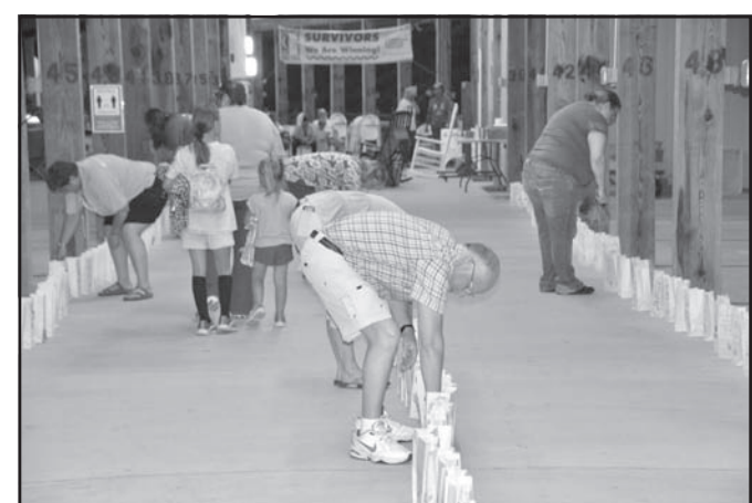
Volunteers lit 300 luminary bags in honor of cancer victims Saturday night at the Farmers Market.